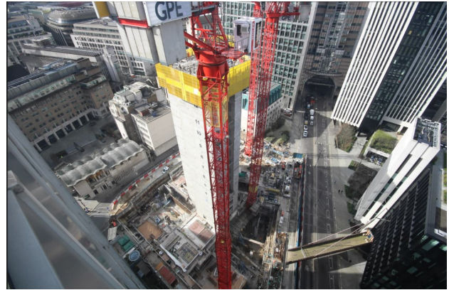
Overview of site progress